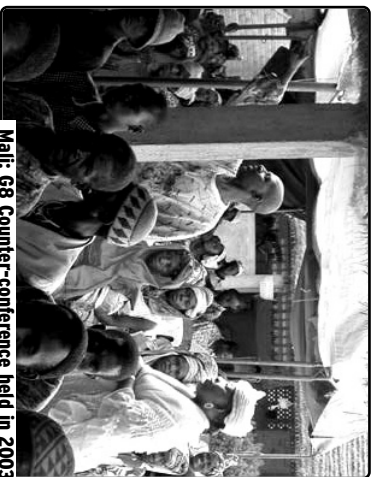
Main: G8 Counter-conference held in 2003

"Any claim to tackle climate change whilst fighting wars for control of the planet's dwindling carbon-based energy reserves is as hypocritical as it is ridiculous. We reject any market-led techno-fixes to the climate crisis by an unelected global elite. Oil fuels capitalism - there cannot be an end to global warming without an end to the system that causes it. Nuclear power is not an alternative, as it is massively wasteful and inextricably linked to the most destructive weapons on the face of the earth. We believe that anti-capitalist