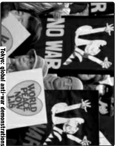
Tokyo: global anti-war demonstrations